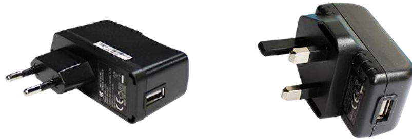
EU Plug SW-6203