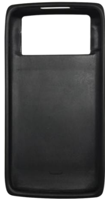
D700_BHT_V1 Not compatible with cradle