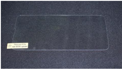
D700_PROTECT_GLASS_V1 screen protector