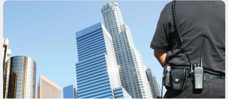
REAL-TIME WORKFORCE MANAGEMENT SOLUTION Leading Integrated Security Services Provider