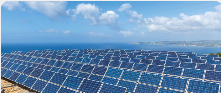
INTELLIGENT SOLAR INFORMATION SYSTEM Leading Manufacturer and Distributor of Solar Panels