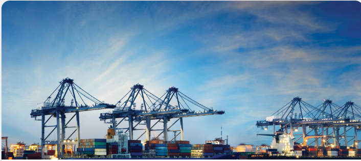
EQUIPMENT TRACKING AND TELEMETRY SYSTEM World's Largest Terex Crane Dealer