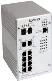
JetNet Industrial Ethernet Switch