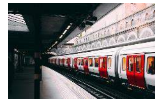
Train & Railway