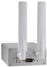
JetPort Industrial Serial Device Server