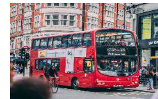
Bus & Vehicle